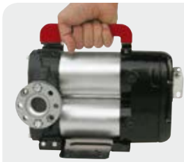
BATTERY KIT BIPUMP

Delivery hose 6 m Cable lenght 4 m Automatic nozzle