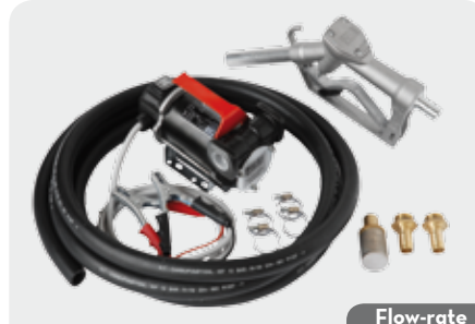
BATTERY KIT 3000 INLINE