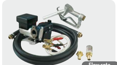
BATTERY KIT PANTHER