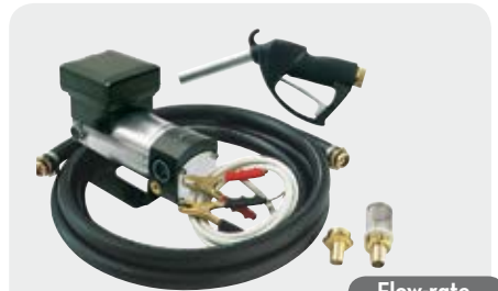
BATTERY KIT OIL