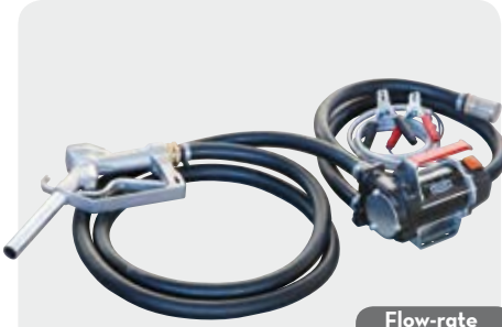
BATTERY KIT 3000